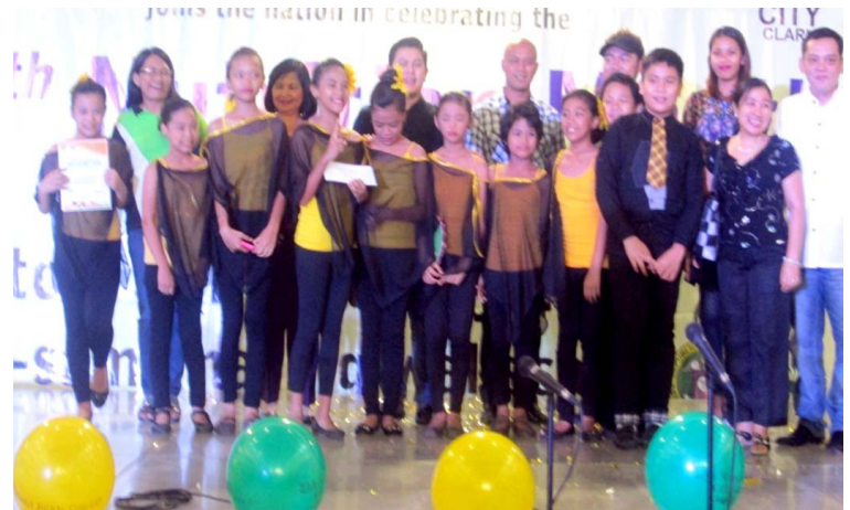
Sto. Domingo Integrated School-Champion in the Nutri-Jingle Contest (Elem. Level) held at SM Clark on August 2.