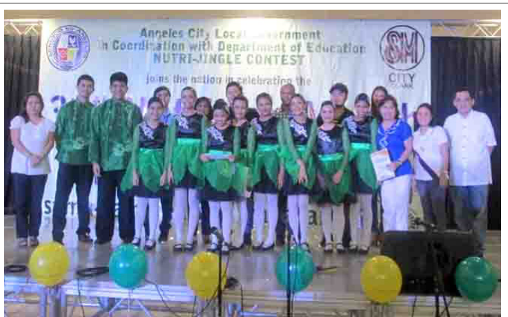
Angeles City Science High School, grand prize winner in Nutri-jingle at SM Clark, August 2.

This implies that Division of Angeles City Team responds to the current challenges of our Department and takes a move in saving learners from their studies so that sooner or later our team will make an impact for the attainment of goals of the Department of Education.