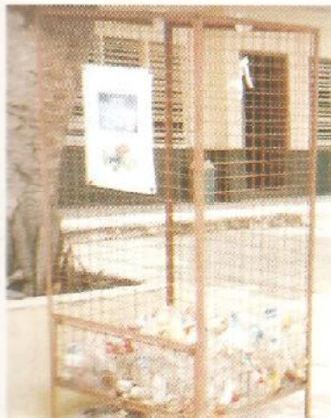
One of the iron trash bins at Sapangbato National Highschool purchased from the proceeds of the solid waste segregation project.